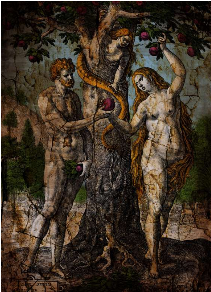
Adam & Eva after Crispijn van de Passe

Drawing pen and acrylic on canvas 190 x 262 cm 2020