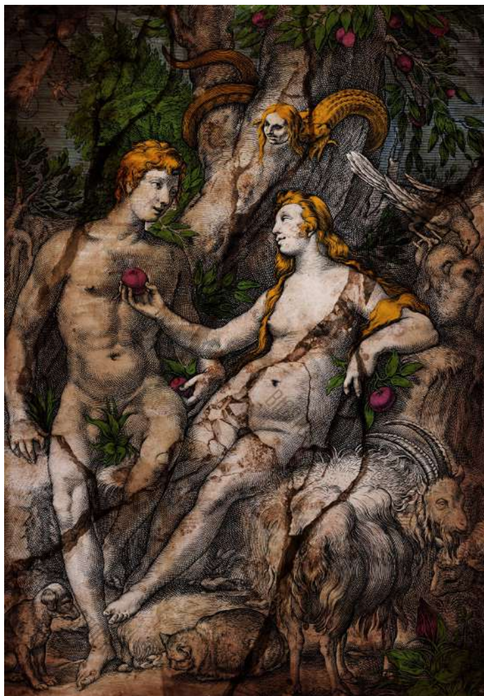
Adam & Eva after Jan Saenredam

Drawing pen and acrylic on canvas 190 x 273 cm 2020