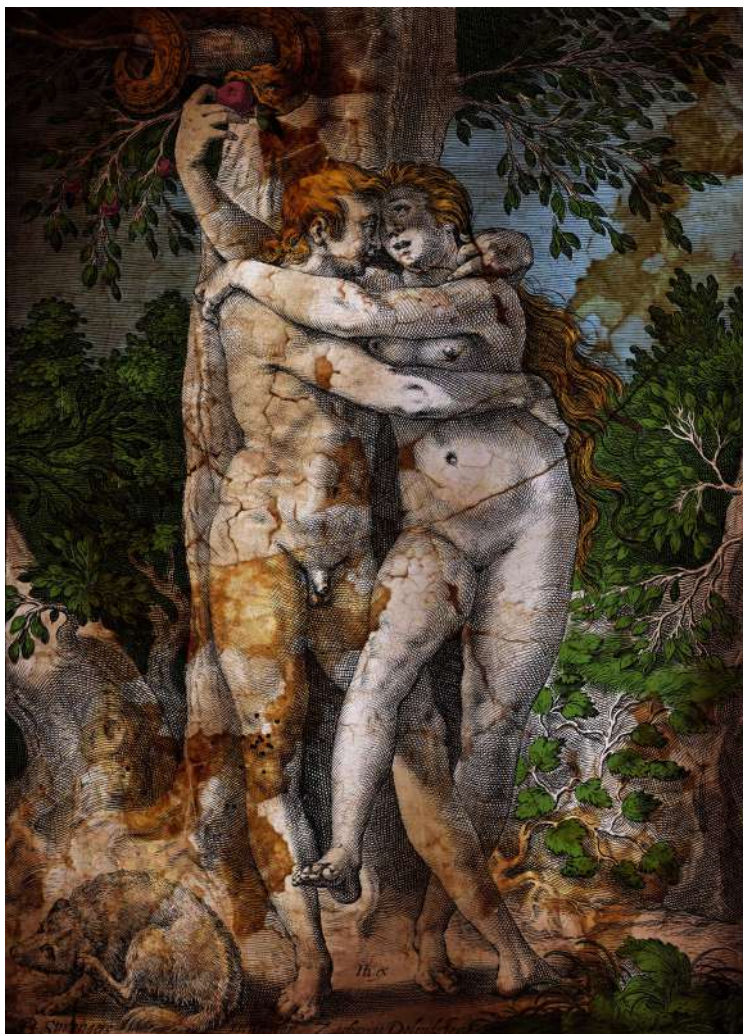
Adam & Eva after Zacharias Dolendo

Drawing pen and acrylic on canvas 190 x 262 cm 2020