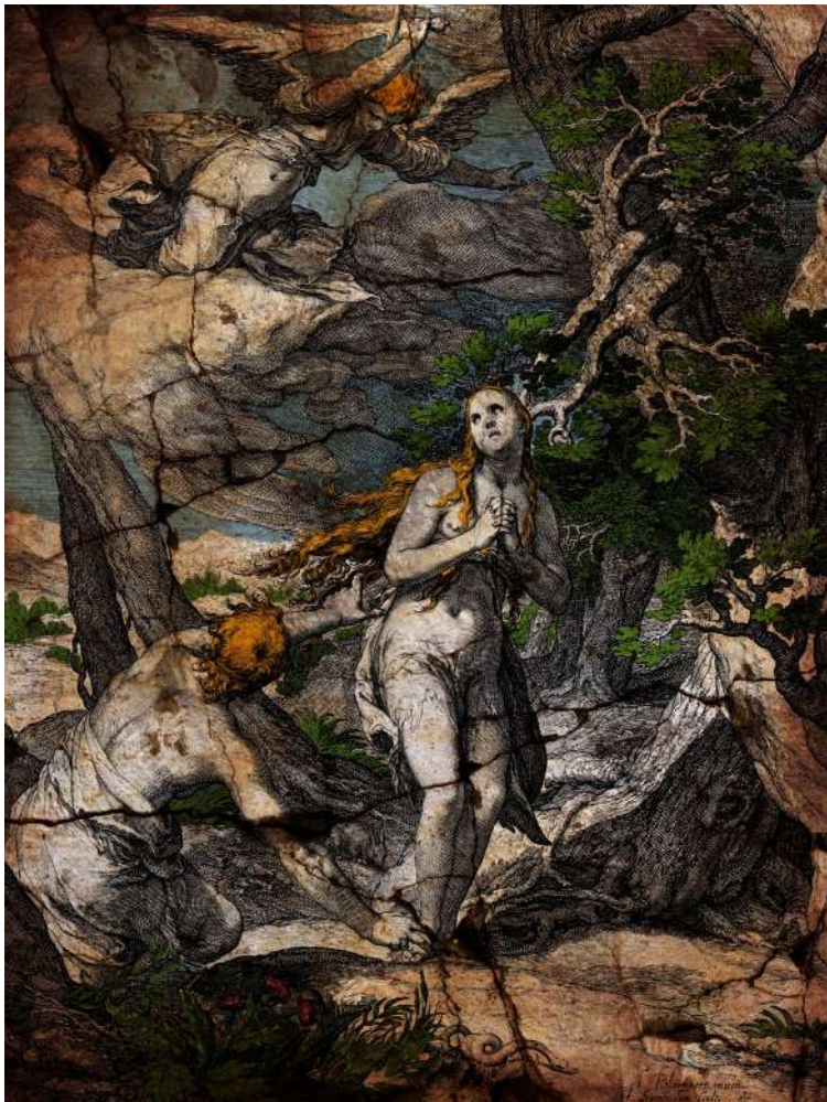
Adam & Eva after Jan Saenredam

Drawing pen and acrylic on canvas 190 x 250 cm 2020