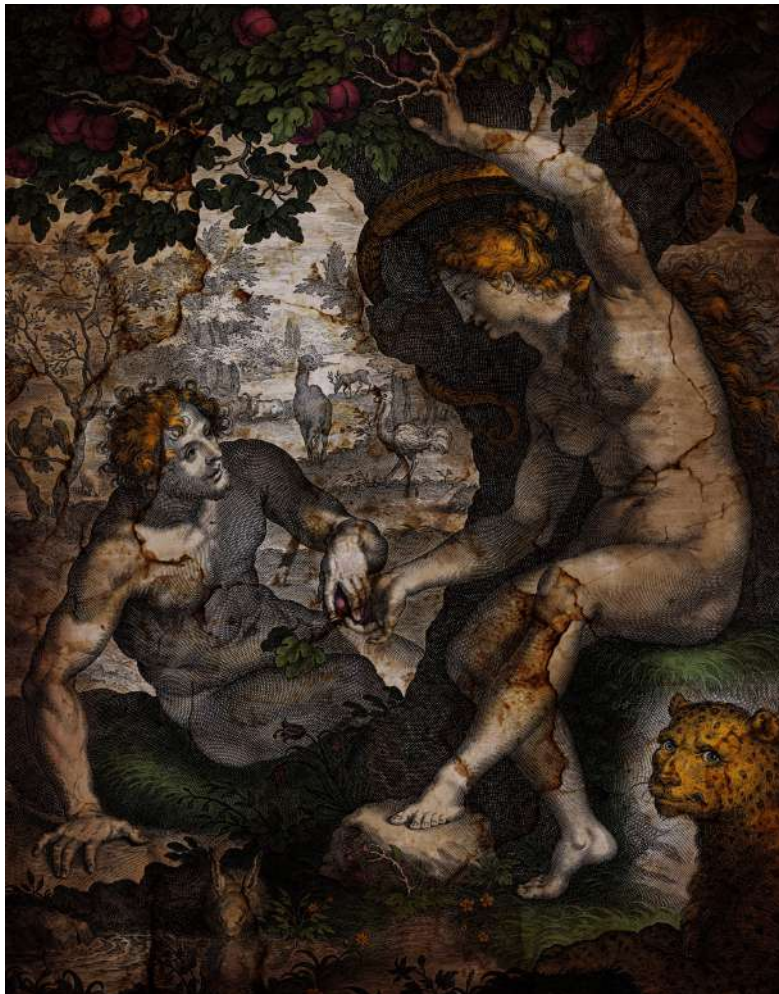
Adam & Eva after Cornelis Galle

Drawing pen and acrylic on canvas 190 x 240 cm 2020