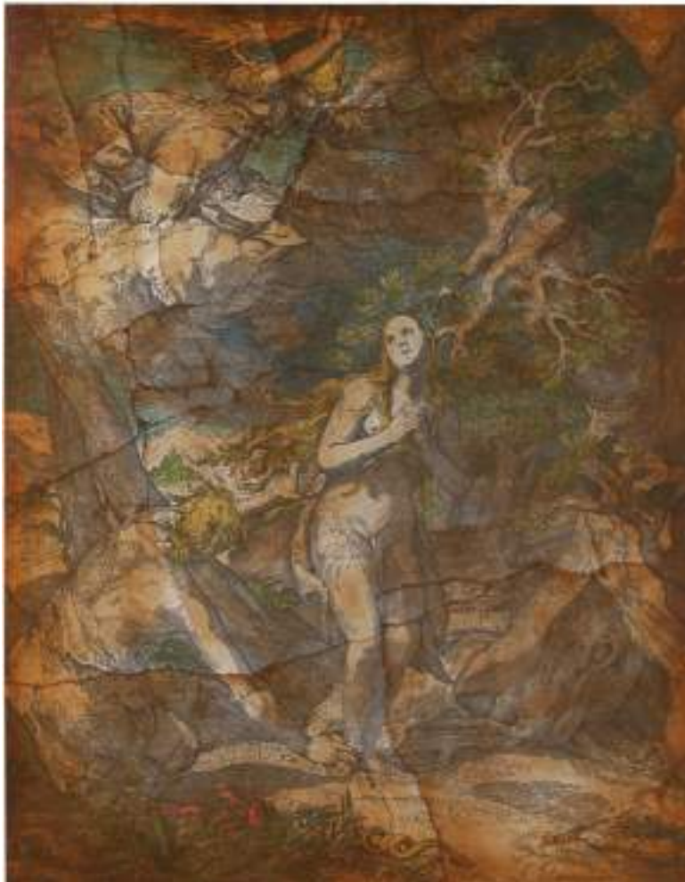
Adam & Eva after Jan Saenredam

Drawing pen and acrylic on canvas 190 x 250 cm 2020