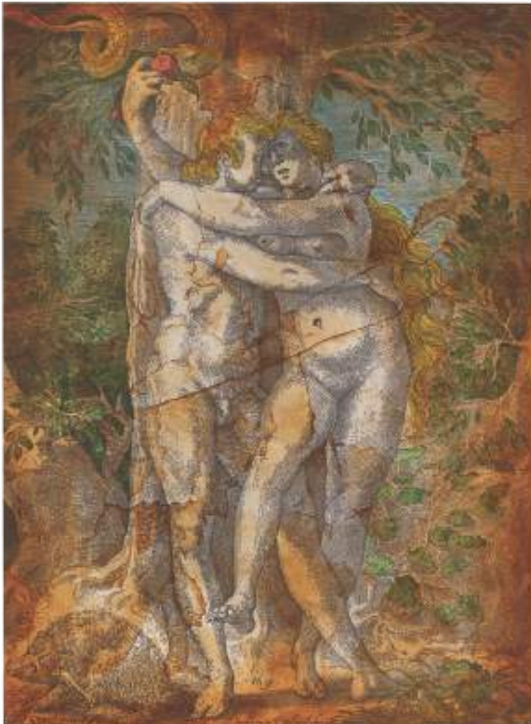
Adam & Eva after Zacharias Dolendo

Drawing pen and acrylic on canvas 190 x 262 cm 2020