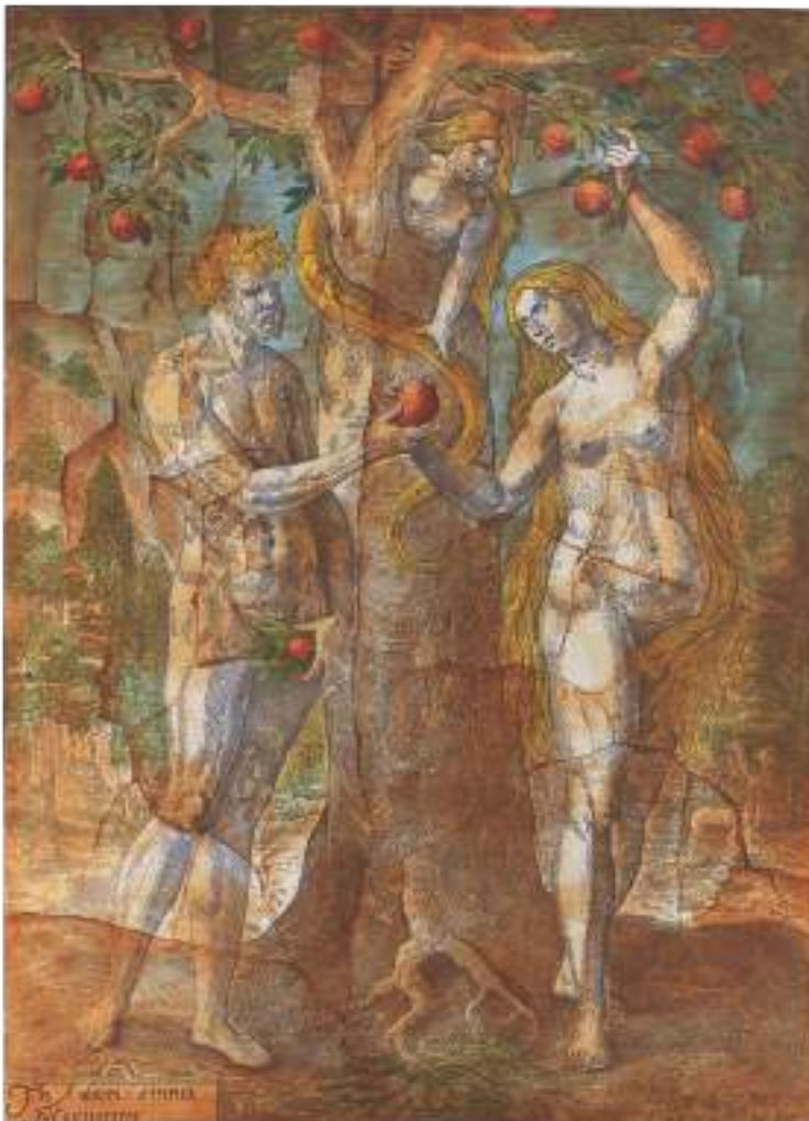
Adam & Eva after Crispijn van de Passe

Drawing pen and acrylic on canvas 190 x 262 cm 2020