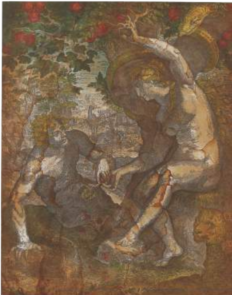
Adam & Eva after Cornelis Galle

Drawing pen and acrylic on canvas 190 x 240 cm 2020