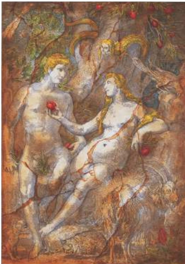
Adam & Eva after Jan Saenredam

Drawing pen and acrylic on canvas 190 x 273 cm 2020